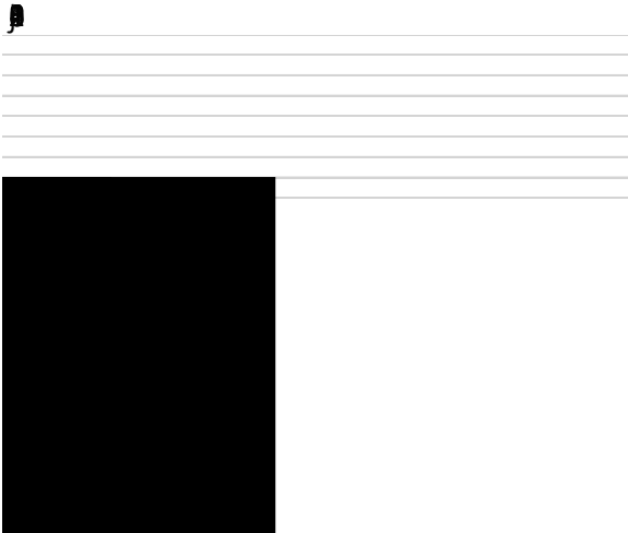
FIG.7: Relative variations of gate trigger current, holding current and latching current versus junction temperature