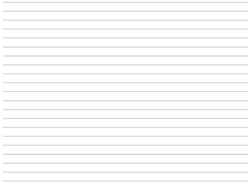
FIG.7: Relative variations of gate trigger current, holding current and latching current versus junction temperature