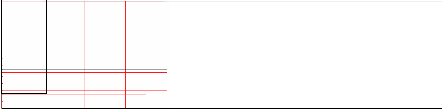
FIG.2: RMS on-state current versus case temperature