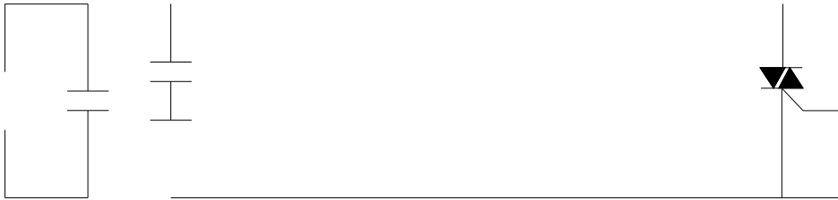
FIG.7 Test circuit for inductive and resistive loads to IEC-61000-4-5 standards